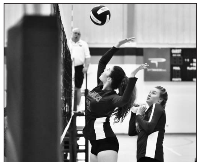
Union County's JV squad in action earlier in the season.

The JV squad has one more game remaining on Oct. 4.