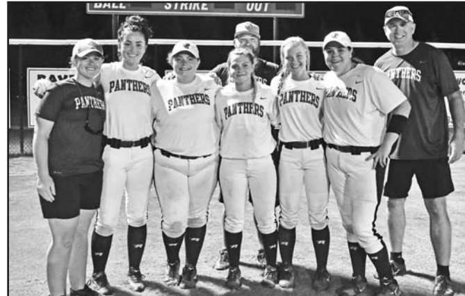
UCHS seniors with coaches